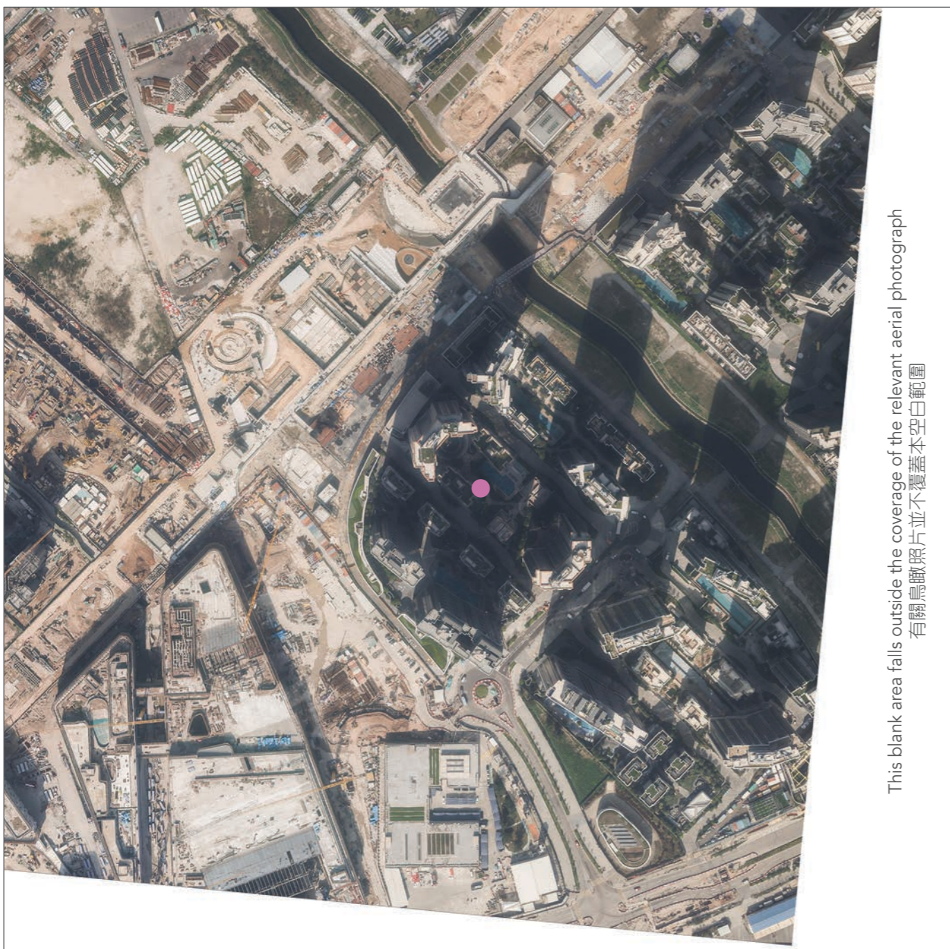
This blank area falls outside the coverage of the relevant aerial photograph 有關鳥瞰照片並不覆蓋本空白範圍